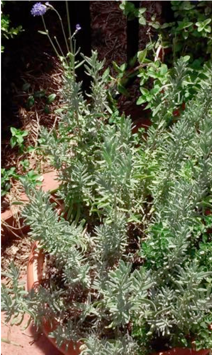
Container at foot of front porch with lavender blooming and germander